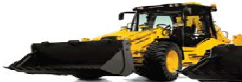
HMK 102 S 4 Wheel Drive