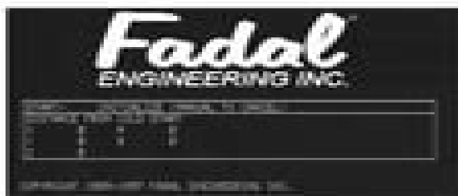
Figure 1-6 Screen display following power-on.

The Fadal logo will display on the monitor screen of the pendant when the VMC is powered on (See Figure 1-6).