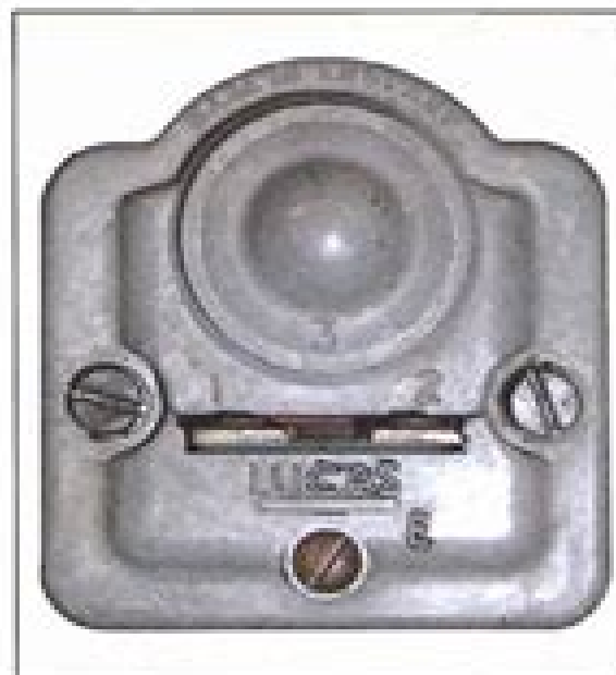
Figure 14.4. Rear view of the DR wiper motor.