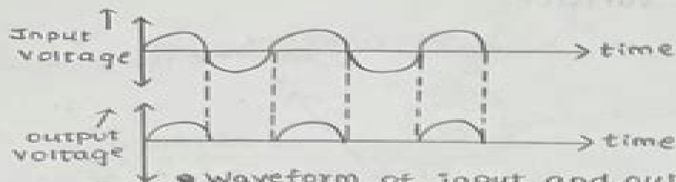
• Waveform of input and output signals for half wave rectifier.