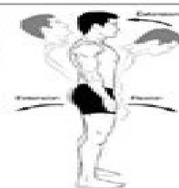
102 Angular movements: flexion and extension of the shoulder and hip.