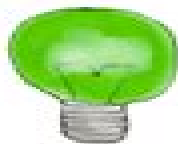
The Green Light