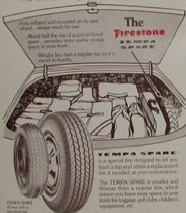
TEMPA SPARE shown with a regular tire