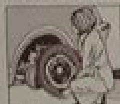
Reinflate flat tire with TEMPA SPARE.