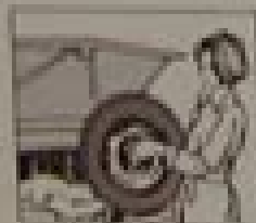
Remove TEMPA SPARE from trunk.