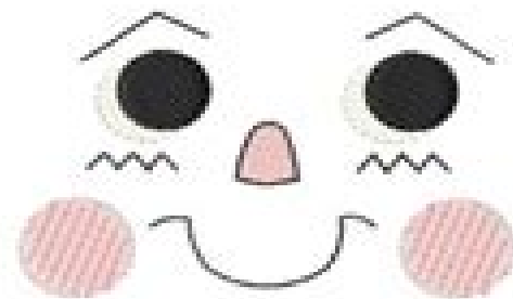
Girl Doll Face 2.82" x 1.88"