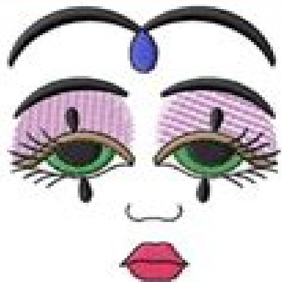
Jester Face 2.33" x 2.68"