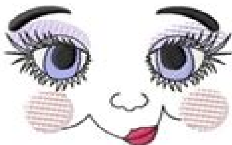
Girl Doll Face 2.91" x 2.06"