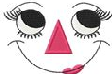
Girl Doll Face 2.83" x 2.15"