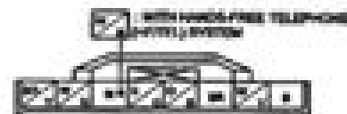
0920-301 CRUISE CONTROL SWITCH / STEERING SWITCH ILLUMINATION / CRUISE CONTROL SWITCH ILLUMINATION / STEERING SWITCH / CLOCK SPRING