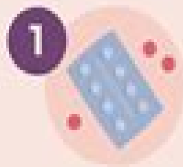
1 Ovarian Hyper- stimulation