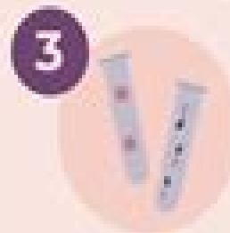
3 Egg and Sperm Preparation