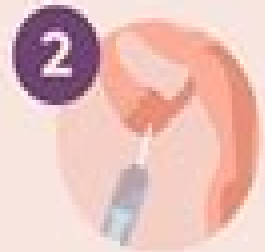
2 Egg retrieval