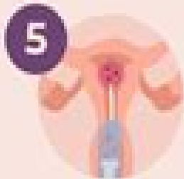
5 Embryo Transfer