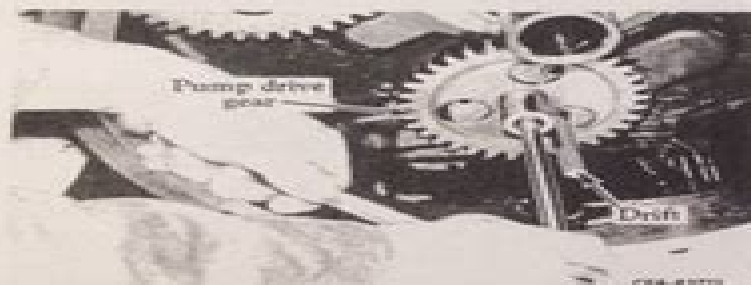
FIG. 24 — Removing the Input Pump Drive Gear Nut