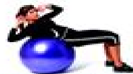
02. oblique crunch

Start in a side-lying position on the ball with knees bent. Lift your hips and crunch your torso towards your knees. Hold for 30 seconds.