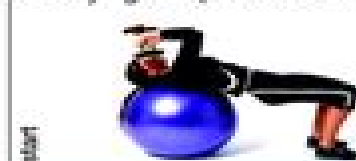
08. lying tricep extension

Start in a lying position on the ball with knees bent. Lift your hips and extend your arms upwards. Lower your arms back to the starting position. Repeat 10-15 times.