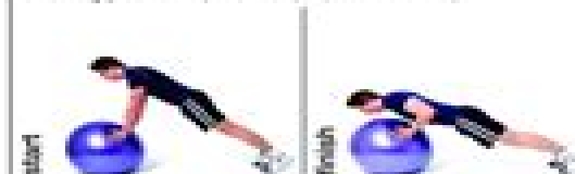
04. gymball push up (hands on)

Start in a plank position with your hands on the ball. Push up with your arms, lifting your hips. Lower your body back to the starting position. Repeat 10-15 times.