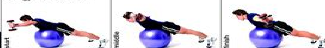
05. gymball combo 01

Start in a plank position with your hands on the ball. Push up with your arms, lifting your hips. Lower your body back to the starting position. Repeat 10-15 times.