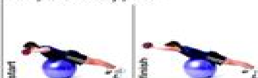
07. prone military press

Start in a prone position with your hands on the ball. Push up with your arms, lifting your hips. Lower your body back to the starting position. Repeat 10-15 times.