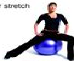
01. adductor stretch

Start in a seated position on the ball with feet flat on the floor. Push your knees out to the sides, away from your body. Hold for 30 seconds.