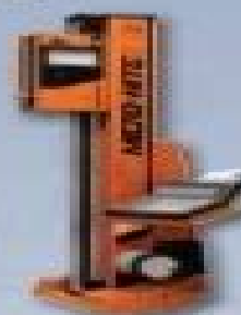
1988 TESA MICRO-HITE version 35