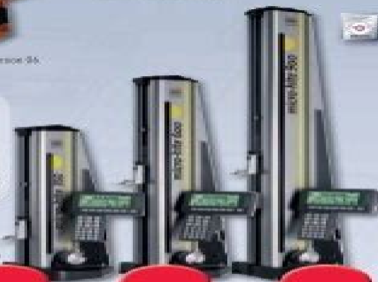
Prices (2 + 3+1 p)