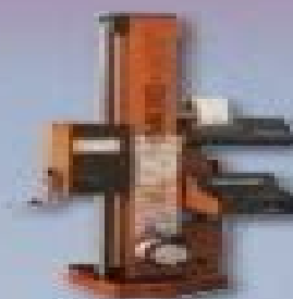
1985 TESA MICRO-HITE version 04