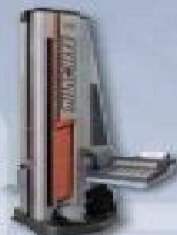
1992 TESA MICRO-HITE version 10

TESA MICRO-HITE manual 350/600/900, the reference for over 20 years!