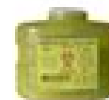
Sharps Container (CSA Approved)