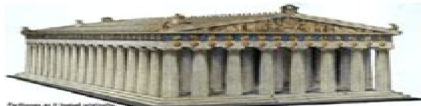
Parthenon as it had originally appeared, Athens, Greece, c. 400 B.C.

Parthenon in Ancient Greece as it would have looked in 400 B.C. (over 2,400 years ago!)