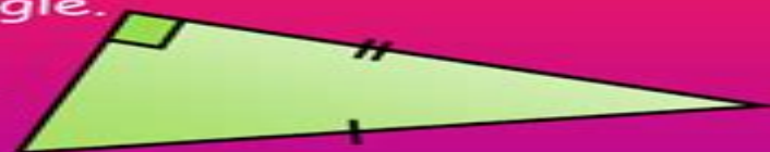
Right angle, hypotenuse, side (RHS)