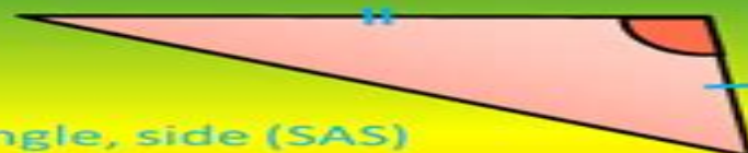
Side, angle, side (SAS)