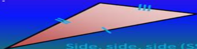
Side, side, side (SSS)