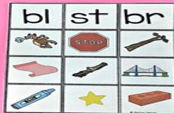
The Three Little Pigs