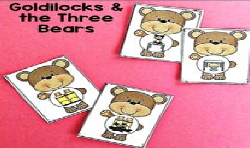
Goldilocks & the Three Bears