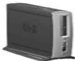
Illustration courtesy of the author.