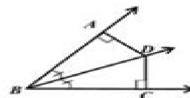
Use this figure for 10 - 13

In problems 14 - 16 use the diagram shown to find each measurement requested.