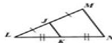
Use this figure for 1 - 7

In problems 8 - 9 use \triangle ABC , where D , E , and F are the midpoints of the sides.