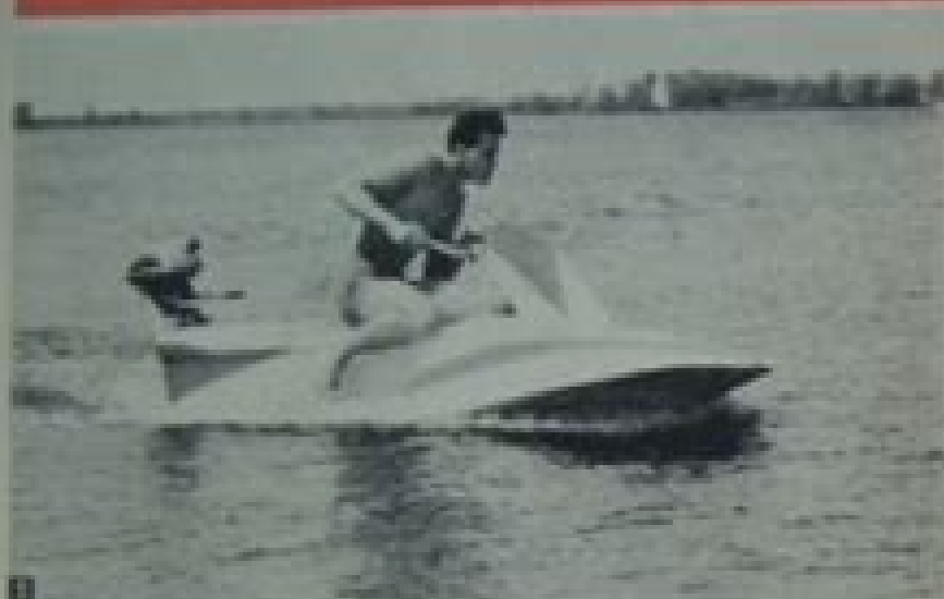
There's some fine performance in just one of the water toys that you won't find about until you see it on display.

You can build this most-fun-per-horsepower waterscooter on Saturday and have it in the water for a full day of boating thrills on Sunday.