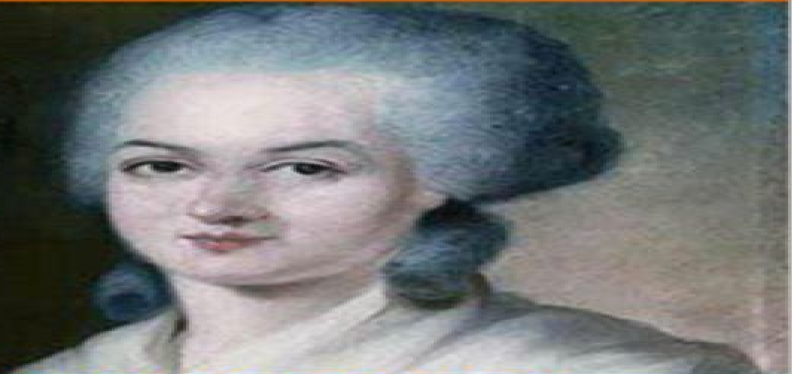
OLYMPE DE GOUGES