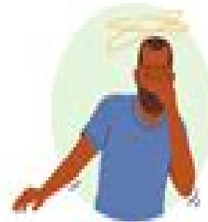
Troubles de l'équilibre