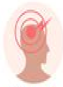
Maux de tête