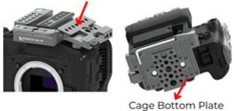
Cage Bottom Plate