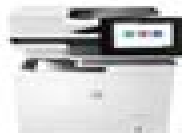
HP LaserJet Managed Flow MFP E62665n

Dynamic security enabled printer. Only intended to be used with cartridges using an HP original chip. Cartridges using a non-HP chip may not work, and those that work today may not work in the future. http://www.hp.com/go/learnaboutsupplies