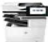
HP LaserJet Managed Flow MFP E62665z