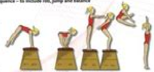
Straddle on box top and straddle jump off