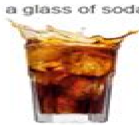
a glass of soda a can of soda