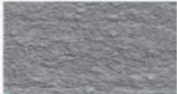
CSP 4 (medium shotblast)