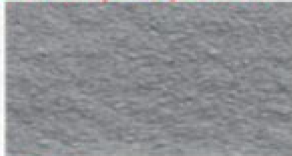
CSP 2 (grinding)