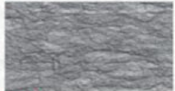
CSP 6 (heavy shotblast)