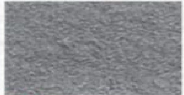
CSP 3 (light shotblast)