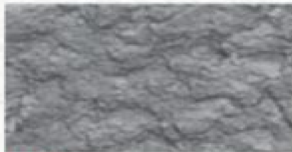
CSP 7 (heavy shotblast)