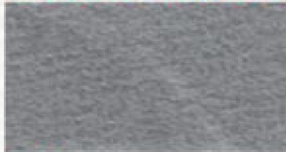
CSP 1 (acid etched)