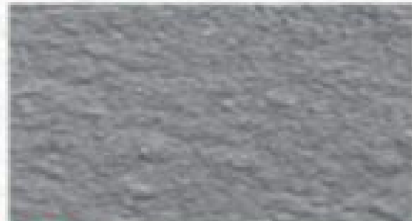
CSP 5 (medium-heavy shotblast)