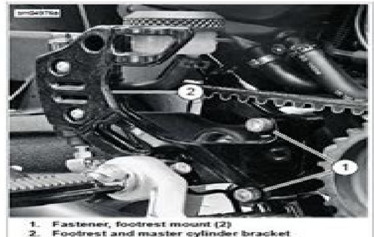
Figure 3-20. Right Footrest and Rear Master Cylinder