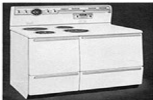
MAJOR APPLIANCE DIVISION 30-814