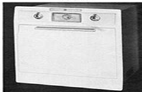
PRODUCT SERVICE PRINTED IN U.S.A.