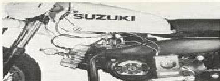
Fig. 81. Connecting timing tester.