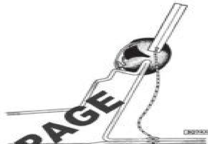
Fig. No. 18 Section through the rear light glass and sealing rubber

Remove excess sealing compound with a rag soaked in white spirit, DO NOT USE THINNERS as this will damage the paintwork.