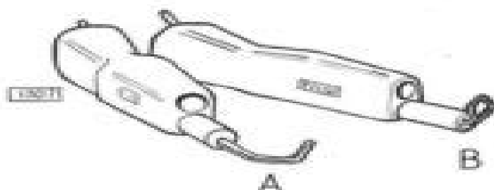
Fig. No. 16 The two special tools (Churchill Tool No. JD 23) used when fitting a windscreen

The rubber should be attached to the backlight aperture with the flat side of the rubber facing the inside of the car.