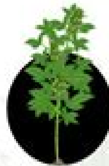
PLANT WITH FLOWER