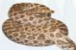
Plains Hog-nosed Snake