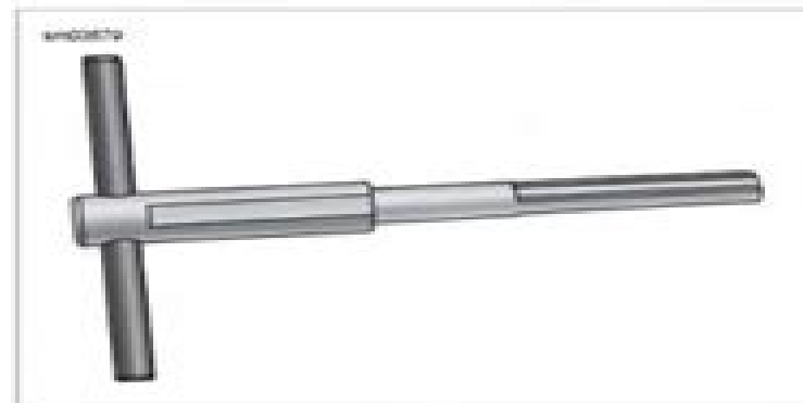
Figure 8-61. Ignition Switch Alignment Tool (HD-45962)