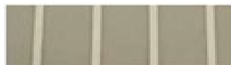
HardiePanel vertical siding with HardieTrim Batten board for the Board & Batten look.

A Complete James Hardie Exterior - Close-up on trim products.