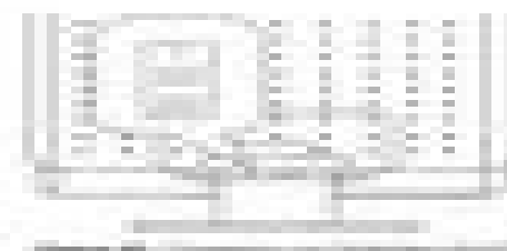
Fig. 17. Relationship layout