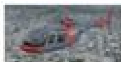
Bell 206B JetRanger Norwegian Air-Sea...