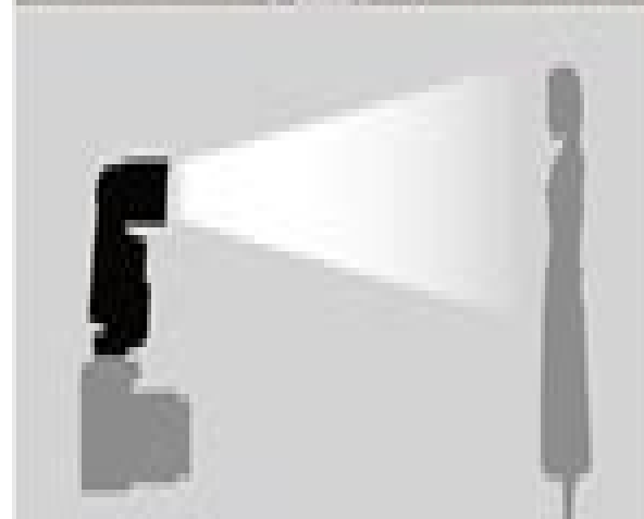
External flash (SA 43) - distant