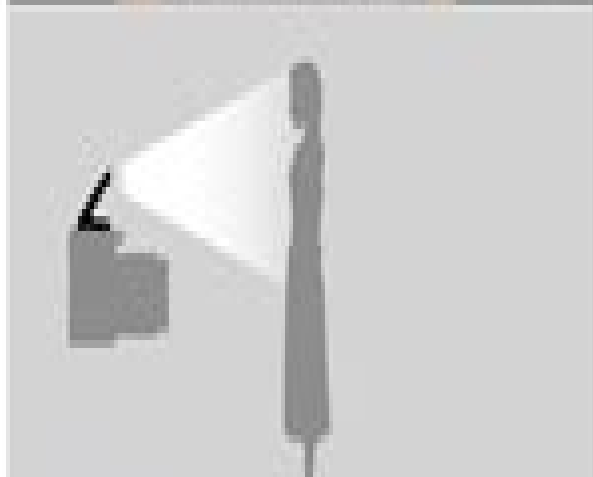
Built-in flash (SA 4-12) - close