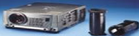
X500U with optional lenses