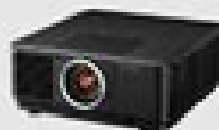
Image Quality, Functionality & Reliability - The bar just got raised a level higher.