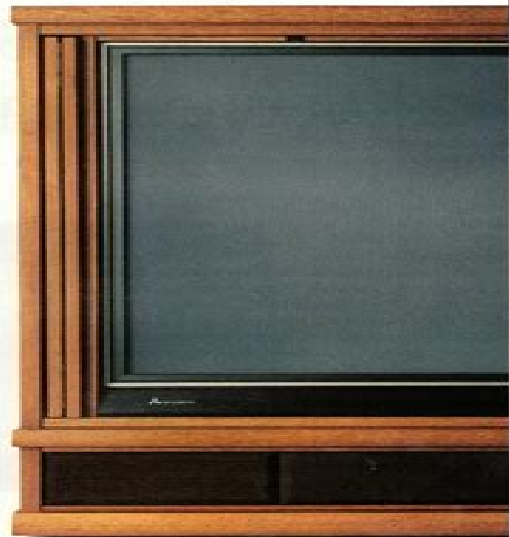
Our new 60-inch big screen television includes our Diamond Vision II™ wireless remote that includes VCR controls (for select Mitsubishi VCRs).

In addition, our new Dynamic Beam forming actively refocuses the beam at every position on the screen, enabling us to minimize distortion. So our Diamond Vision II™ offers 15% sharper focus at the center of the picture and 40% improvement at the edges.