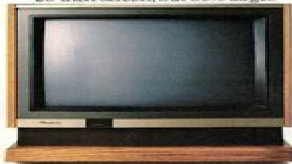
The world's first 35-inch, direct-view television, 86% larger than a 26-inch set, and can deliver a stunning 760 lines of resolution.

Which helps explain how in 1986, we were the only television manufacturer with the technology to create a 35-inch conventional tube television. With a picture as sharp and clear as a 26-inch screen, but 86% larger.