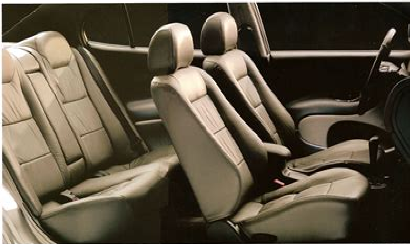
Detalle de cuero japonés