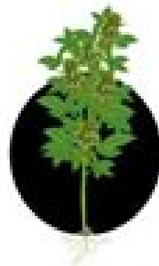
PLANT WITH FRUIT