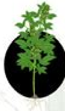
PLANT WITH FLOWER