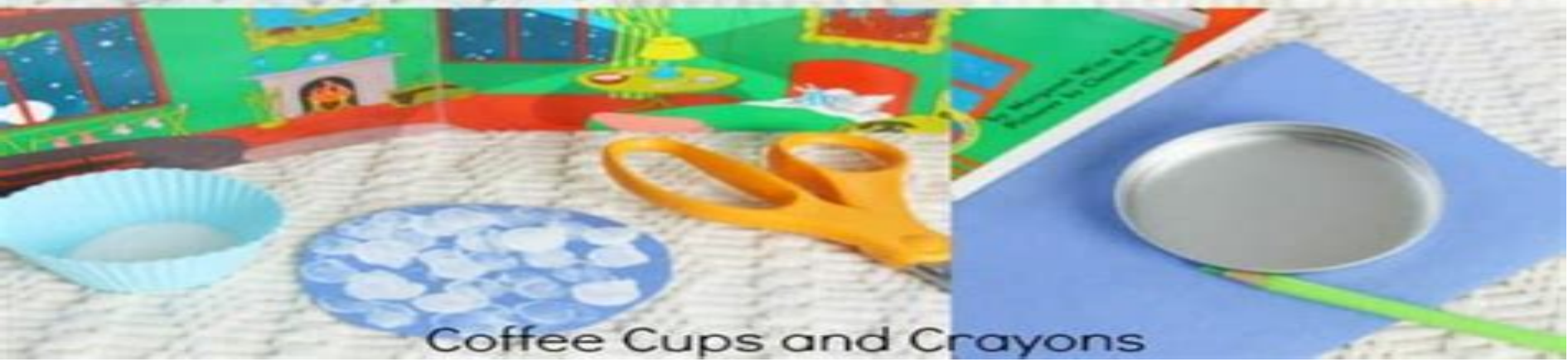
Coffee Cups and Crayons