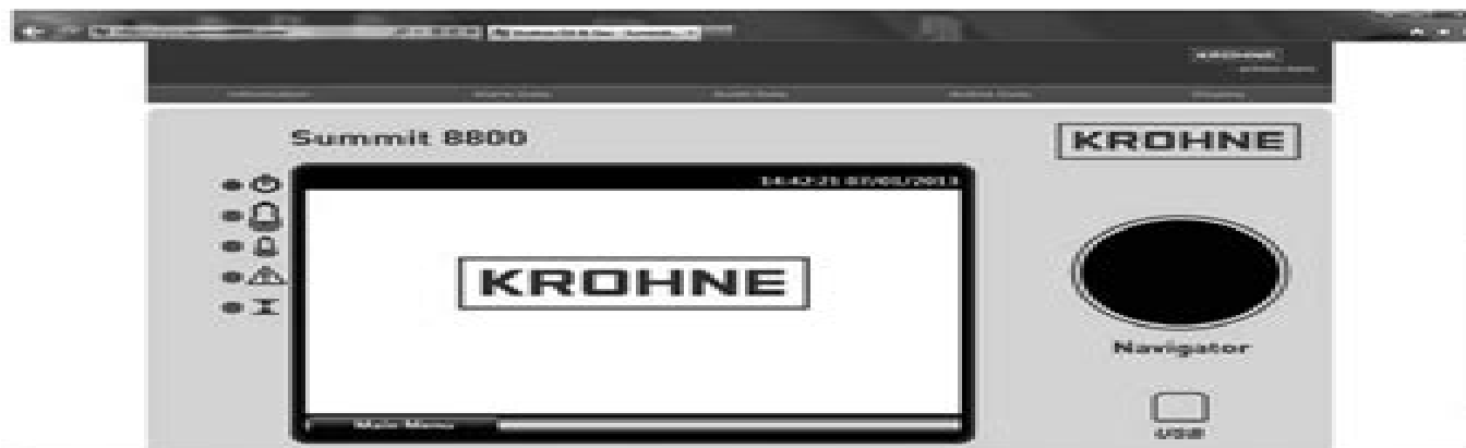
Figure 97 Main Page

In the display page the SUMMIT 8800 can be viewed remotely. The display operates very similar to the actual SUMMIT 8800 with all the same pages. No special configuration is needed.