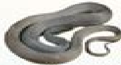
Plainbelly Water Snake