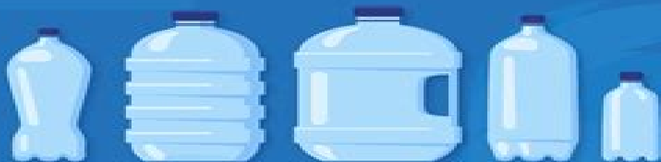
Plenty of water