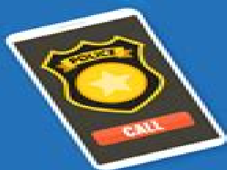
Emergency phone numbers