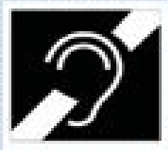
International Symbol of Access for Hearing Loss