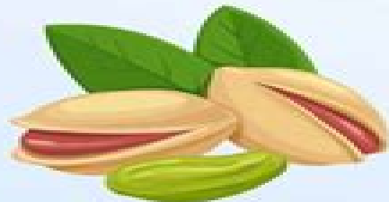
NUTS & SEEDS