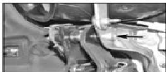
5.3 The clutch pedal bolt (arrowed) is also the pivot for the brake pedal

disconnect the master cylinder pushrod from the clutch pedal (see illustration 3.2).