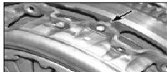
5.4 Locating dowel (arrowed) – marked for refitting

6 Check the friction disc facings for signs of wear, damage or oil contamination. If the friction material is cracked, burnt, scored or damaged, or if it is contaminated with oil or grease (shown by shiny black patches), the friction disc must be renewed.